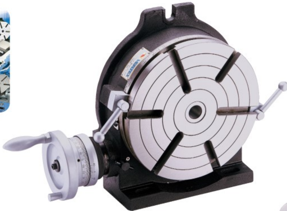
HV-6, 8, 10, 12, 14, 16